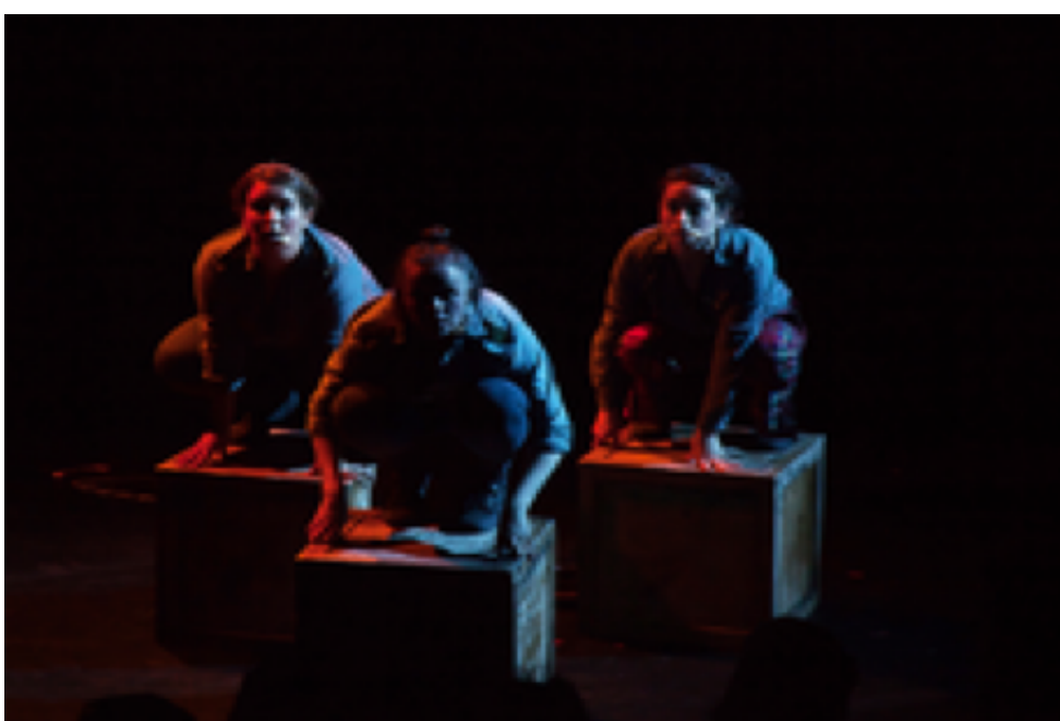
Out of Chaos Theatre

On March 5 at 2 P.M. we will host an interactive performance of Aeschylus's "The Suppliants" by Out of Chaos Theatre . "The Suppliants" tells the story of the Danaids who fled their native Egypt to escape forced marriage. Arriving as refugees in Greece, they supplicate the gods and the king of the city of Argos, seeking a refuge and a new home. The post-performance discussion features a panel of speakers on the topics of refugees in Greece and the Mediterranean, on federal approaches to U.S. immigration, and on the work of local immigration activists. The full program may be found here .